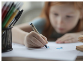
School Uniform Appeal 2022