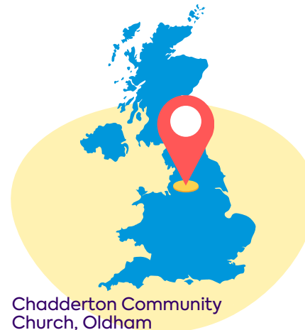
Chadderton Community Church, Oldham