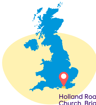
Holland Road Baptist Church, Brighton