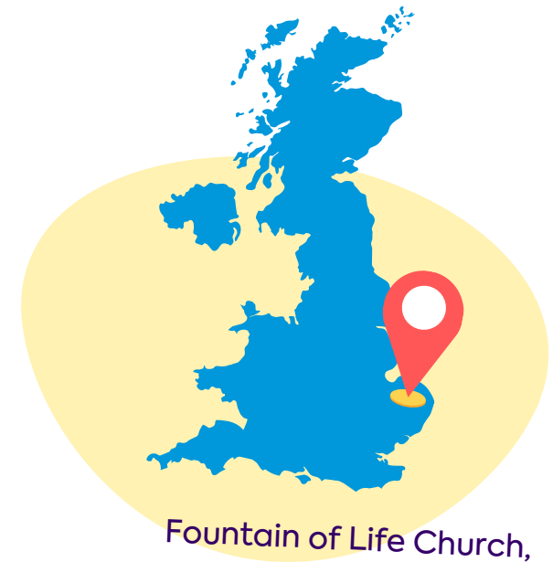
Fountain of Life Church, Ashill, Norfolk